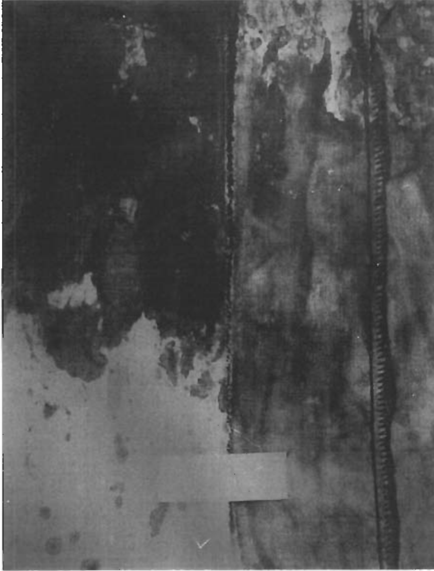
INSIDE VIEW OF TORN LEFT SLEEVE OF BLUE PAJAMA TOP, EXHIBIT 101 [D-210](Q-12) FOUND ON TOP OF COLLETTE MAC DONALD